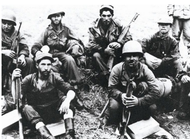
Borinqueneers in Korea, June 1951.

They served in the US Army with distinction. They were heroes in battle. They were a segregated military unit that endured the hardships of discrimination while serving their country. And, at times, they fought without adequate training, support, and leadership. Known as the "Borinqueneers" , this regiment of mainly Puerto Rican soldiers served in WWI, WWII, and the Korean War.